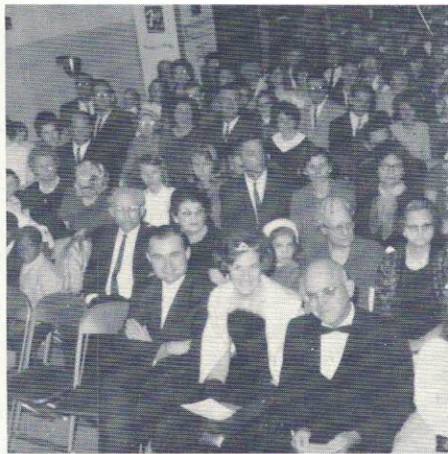
An appreciative audience.

was attended by approximately 500 people.