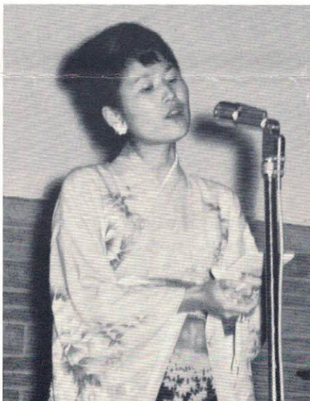
A song from the "old country."