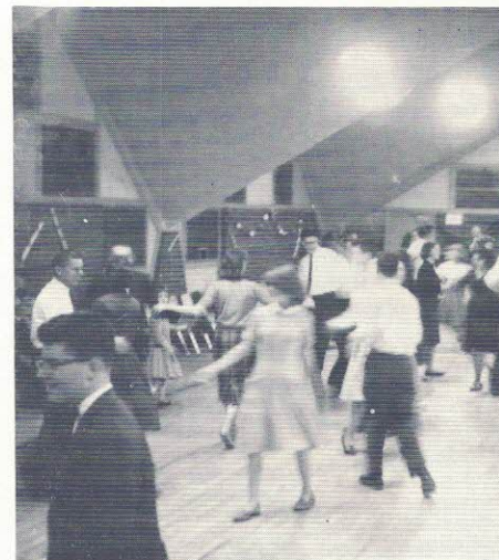
Swing your partners!

It was again a joy to meet with old friends and we look forward to making it four years in a row.