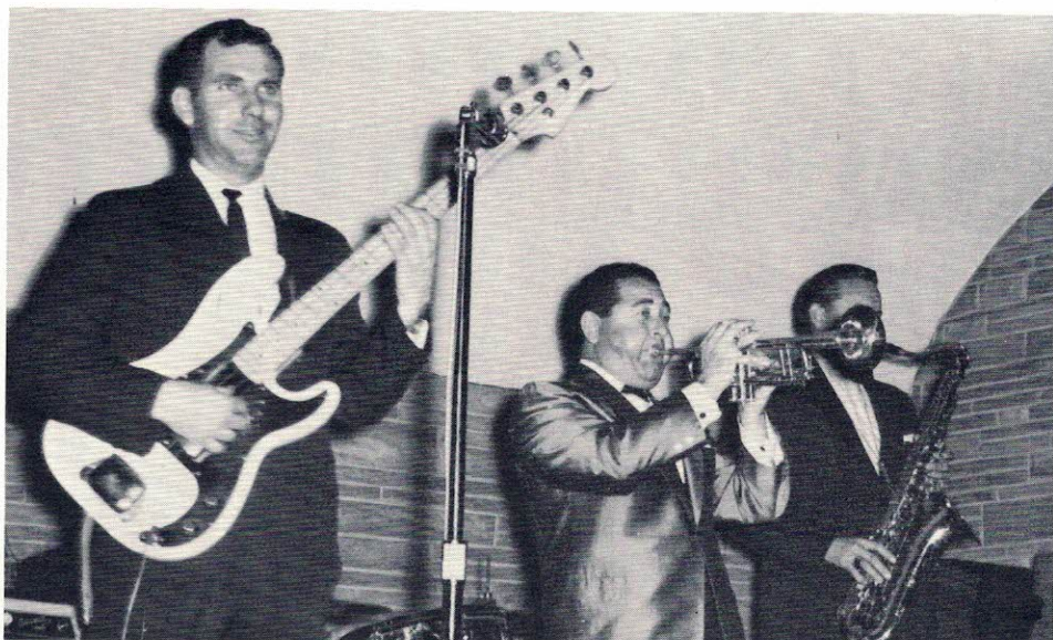
A hot combo!

Everyone agreed that this year's semiformal was the best in every way.