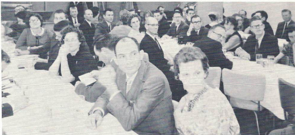
A combined meeting is interesting.