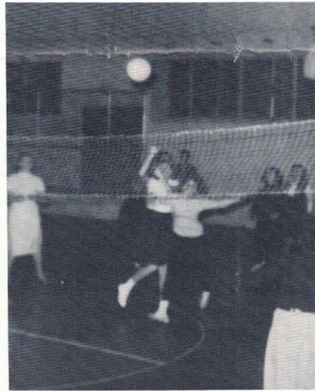
Over the net!