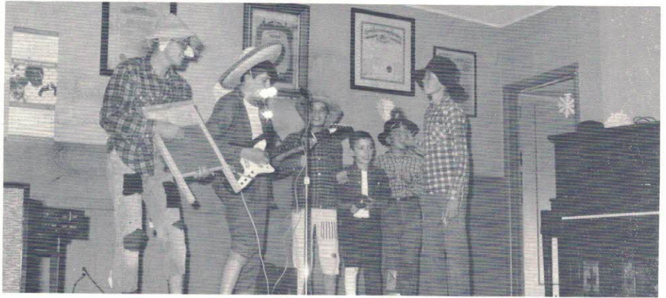
Who let them in?

It would seem the following months will hold interest, fun and fellowship for Denver's young people.