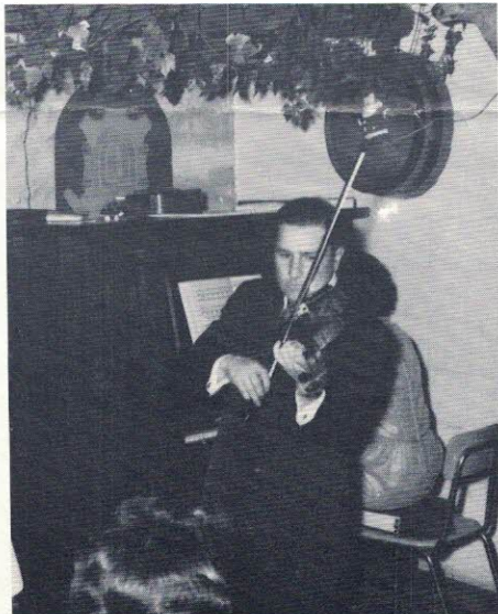
The "Music Man."