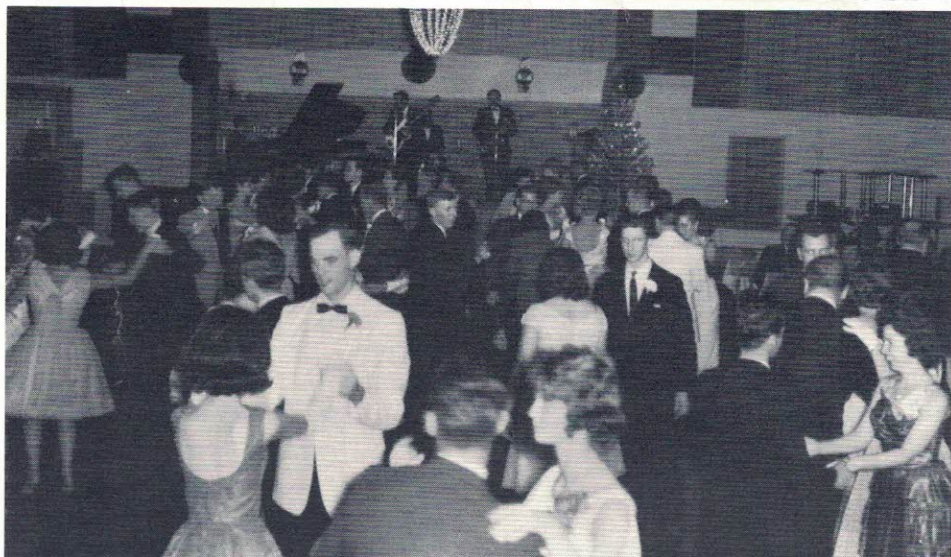
Having a Ball!