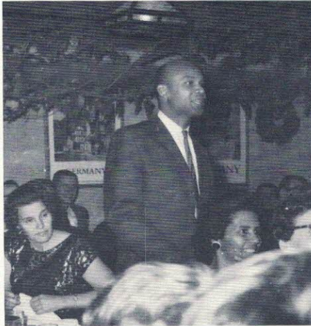
This is the way I look at it!