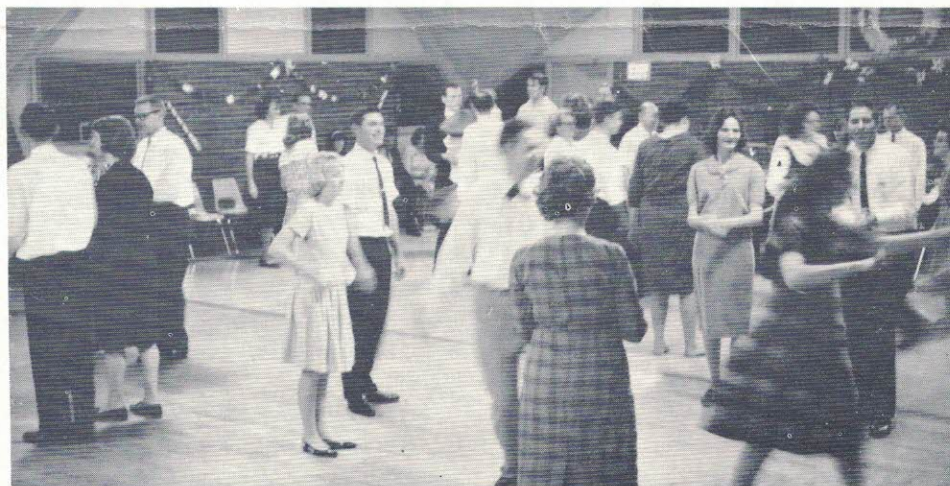
Everybody is "Square"!